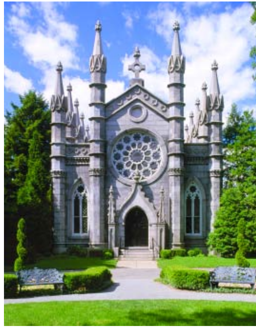
Bigelow Chapel, ©Richard Cheek