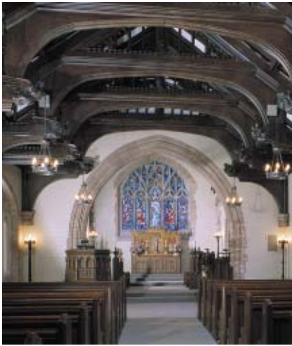
Story Chapel, interior