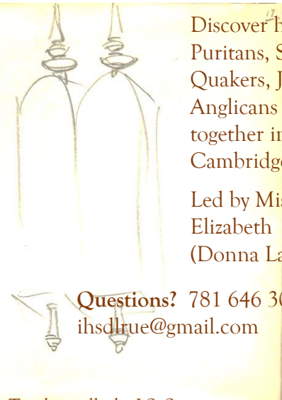
Torah scrolls, by J.S. Sargent Harvard Art Museums

Meet at information kiosk, Harvard Square